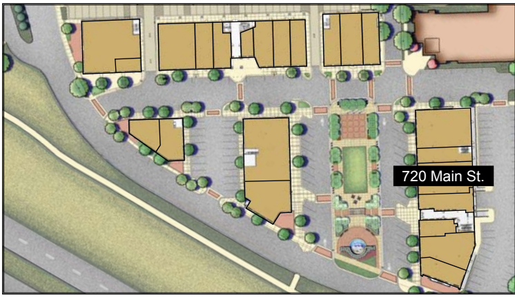
Key Plan: 720 Main Street