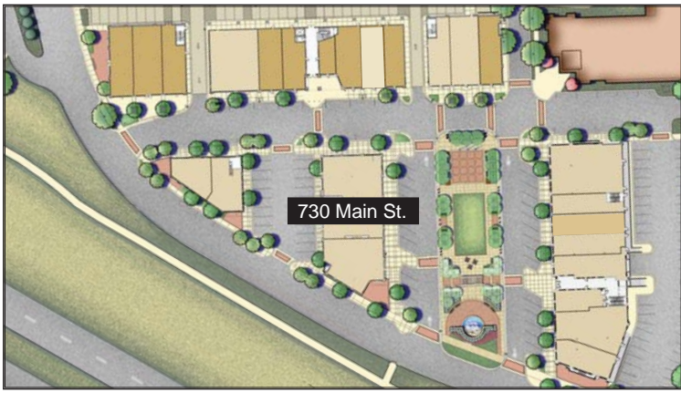
Key Plan: 730 Main Street