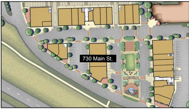
Key Plan: 730 Main Street