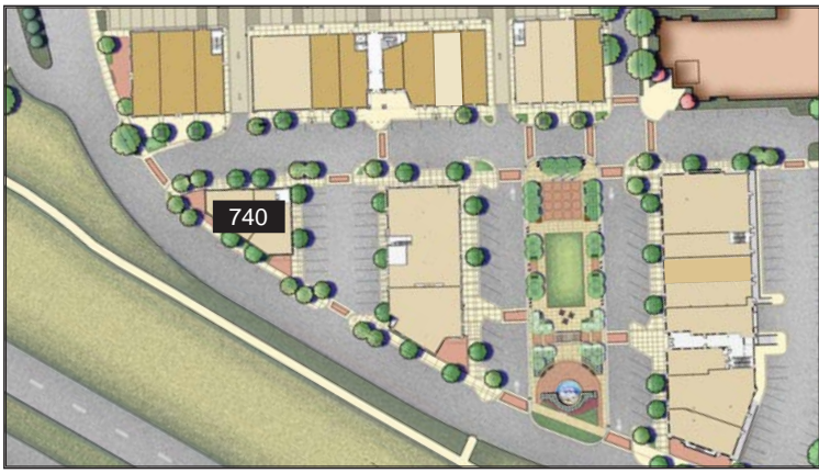
Key Plan: 740 Main Street