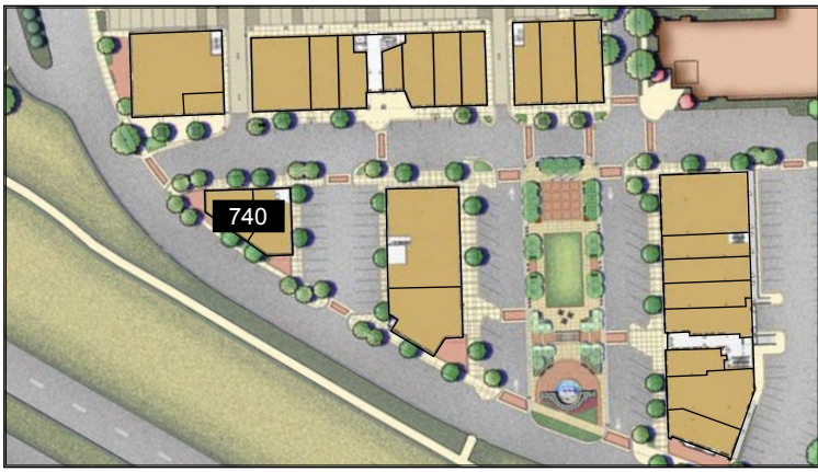
Key Plan: 740 Main Street