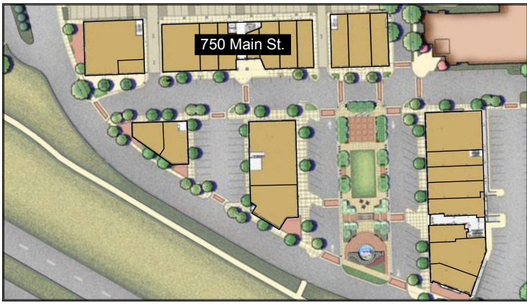
Key Plan: 750 Main Street